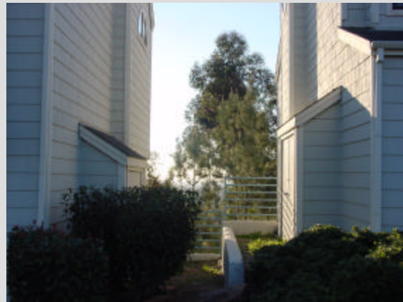
Figure 5: Photo from Location 2C