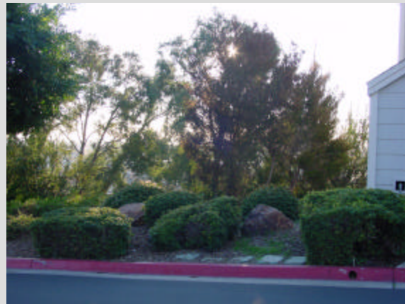
Figure 4: Photo from Location 2B

Extra link margin due to the high power radio made it possible to stretch NLOS to 7 miles as well as some fairly difficult NLOS links at shorter distances.