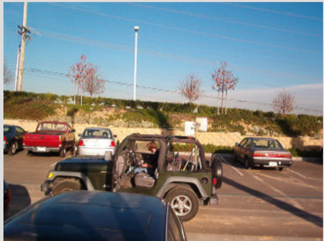
Figure 2: Photo from Location 1A