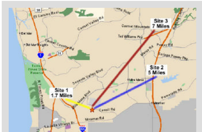
Figure 1: Map of the general area.