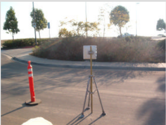
Figure 7: Photo from Location 3B