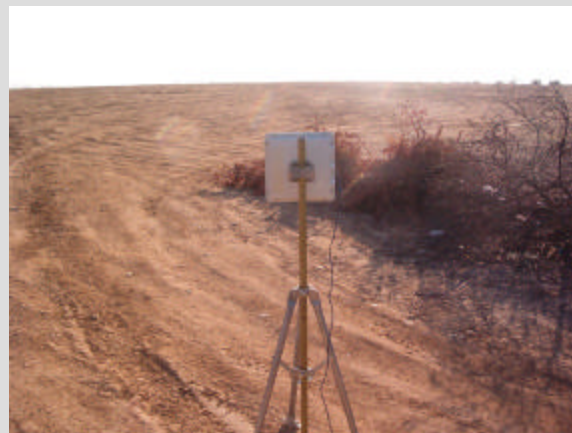
Figure 6: Photo from Location 3A