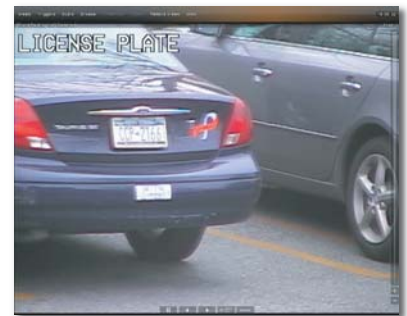
Live monitoring with instant investigation in Ocularis Client Lite

The Power of IP Video Surveillance IP-Based surveillance means that cameras can be securely monitored, recorded, administered and accessed from any authorized workstation or portable device within the local network or over the Internet. With NetDVMS, the most powerful IP-based solution by far, OnSSI has established its leadership in the new era of surveillance management systems.