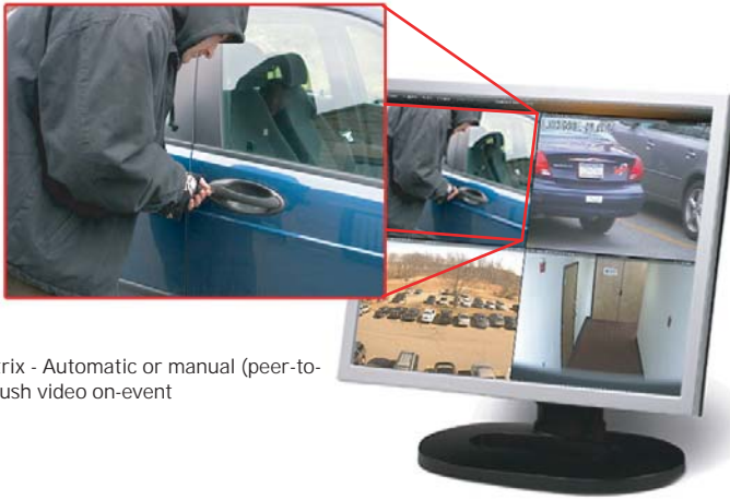
NetMatrix - Automatic or manual (peer-to-peer) push video on-event

Video Intelligence and Content Analytics With more video content streaming from ever-growing camera systems, the need for video intelligence has become imperative. Video content analytics allow the same number or fewer security operators to address the continually growing amount of video data.