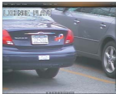
Live monitoring with instant investigation in Ocularis Client Lite

The Power of IP Video Surveillance IP-Based surveillance means that cameras can be securely monitored, recorded, administered and accessed from any authorized workstation or portable device within the local network or over the Internet. With NetDVMS, the most powerful IP-based solution by far, OnSSI has established its leadership in the new era of surveillance management systems.