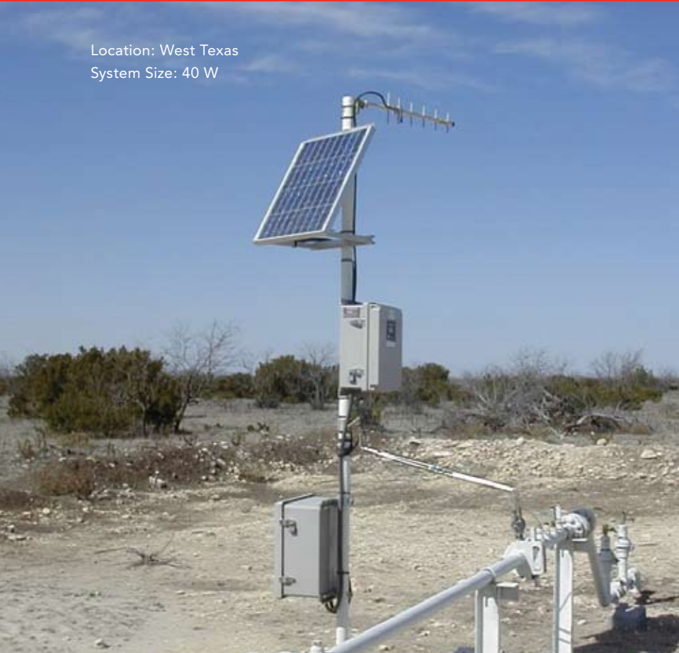
Location: West Texas System Size: 40 W

From Cathodic Protection (CP) and valve actuation to flow monitoring, Kyocera has provided reliable and cost effective solutions to the Oil & Gas Industry for more than 30 years. Kyocera designed CP systems ensure maximum up-time by avoiding costly repairs due to the natural corrosion process of metals used in harsh environments.