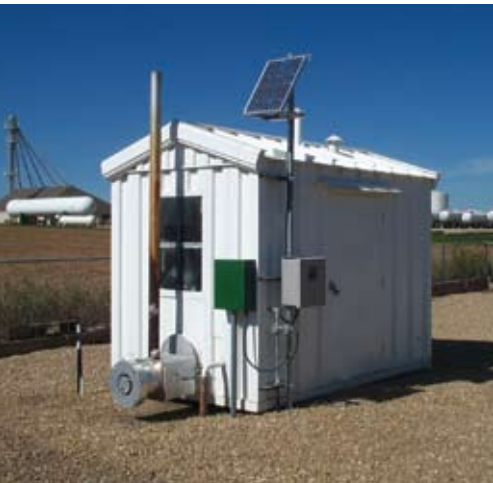
Location: Central Iowa System Size: 40 W