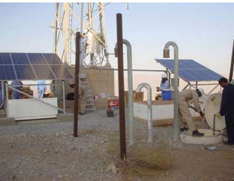
Location: Oman System Size: 1.9 kW

Kyocera solar systems are ideal for the Oil and Gas industry because they deliver clean, reliable, renewable power to such applications as Cathodic Protection (CP) systems and Remote Data Acquisition for both land-based and off-shore pipelines.