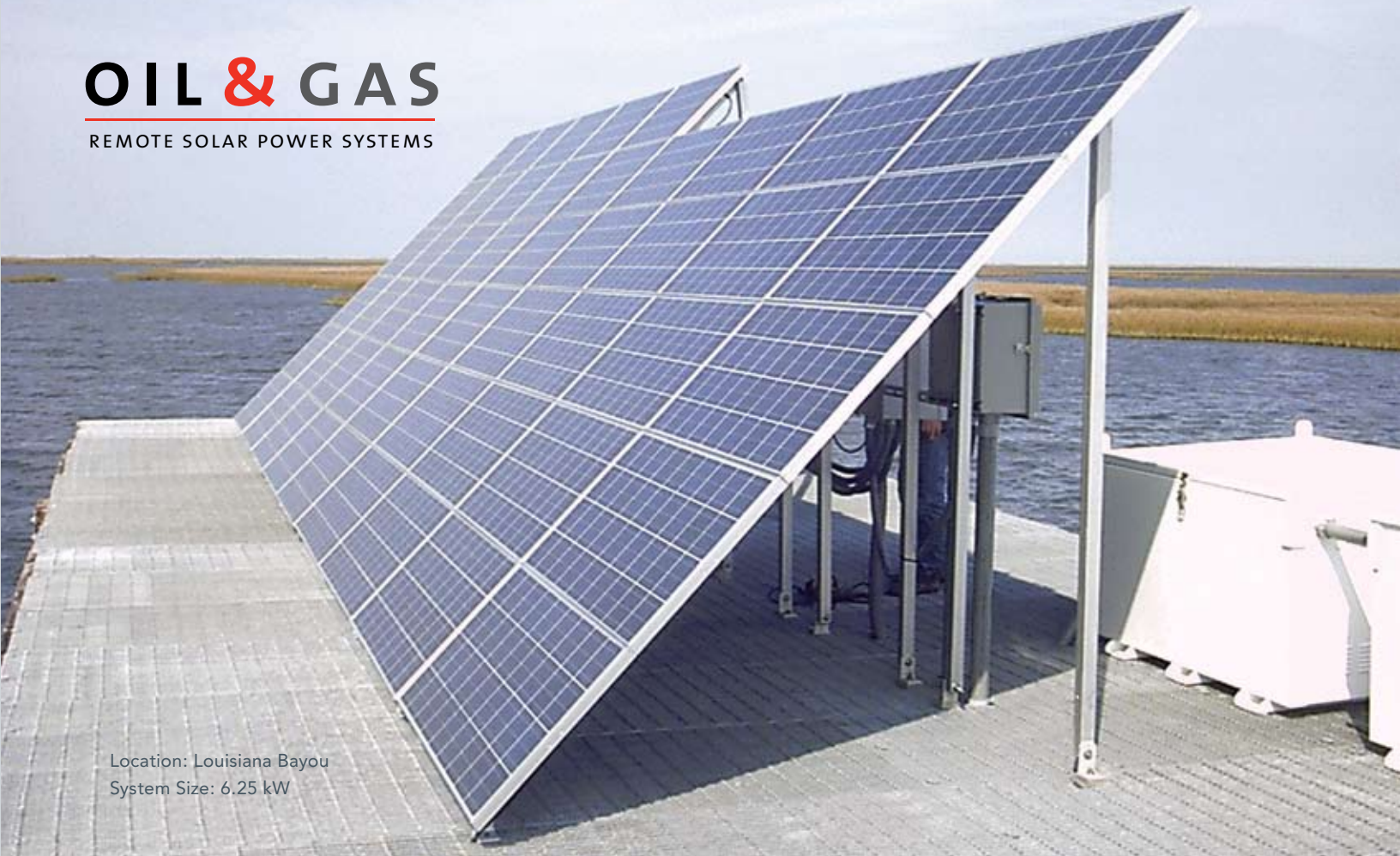
Location: Louisiana Bayou System Size: 6.25 kW