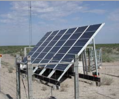
Location: Oil Fields of West Texas System Size: 4.3 kW

Kyocera's Oil & Gas Remote Solar Power Systems are well suited to operating automation equipment used by the Oil and Gas Industry. This equipment includes high-efficiency gas-flow computers, remote telemetry units (RTU's), supervisory control and data acquisition equipment (SCADA). The equipment's low power requirements and typically remote locations often make a PV system the most cost-effective power source.