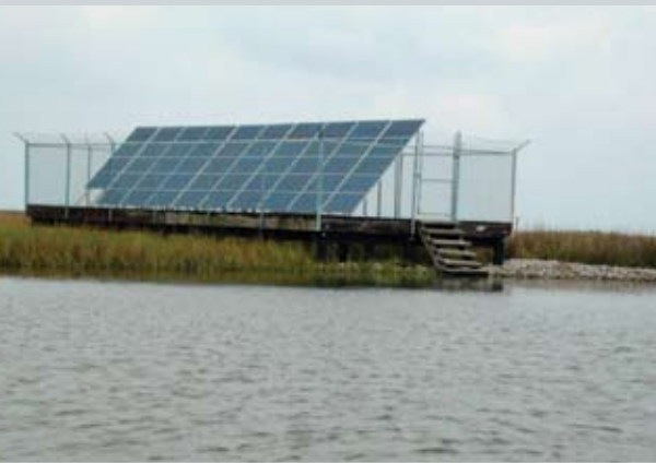
Location: Louisiana Bayou System Size: 3.9 kW