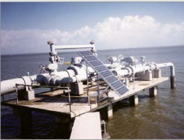
Location: Louisiana Bayou System Size: 7.7kW

Kyocera's Cathodic Protection (CP) systems include solar modules, mounting structures, CP controller (with integrated solar charge regulation), storage batteries, system enclosure, installation/wiring kit and instruction manual.