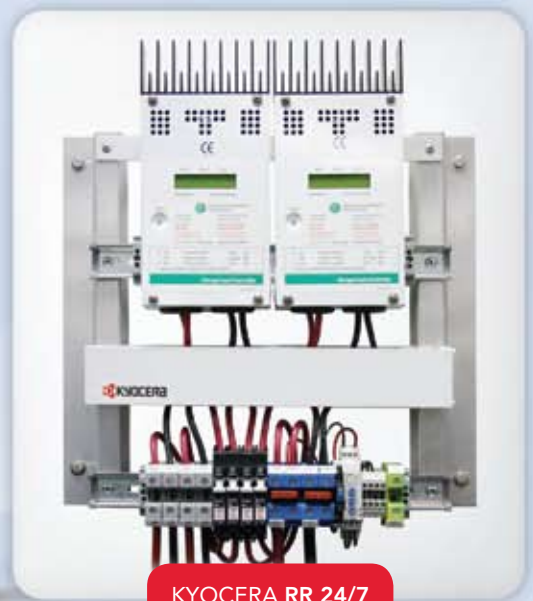
KYOCERA RR 24/7