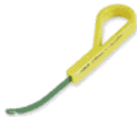
Insulated Lacing Needle

Once you have chosen the pathway, the next step is to permanently fasten or attach the cable or bundles to approved support structures or hardware. Remember, waxed twine lacing should be used in telecommunications spaces and equipment racks, frames, cabinets or bays, and not above the ceiling or in spaces classified as plenums or locations that may present fire hazards.