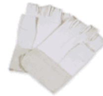
Fingerless Lacing Gloves

Next, determine the pathway you want your cables to follow and start bundling as you go. The key to cable lacing is to understand the prime directives which are safety, performance, quality, aesthetics, and, of course, productivity.