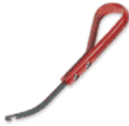
Curved Lacing Needle

You will also need a selection of cable lacing needles. These tools come in many different varieties (curved hooks, straight hooks, flat metal needles, lacing loops, insulated, non-insulated, etc.). The styles you choose may depend on a particular situation, or personal preference. If you are doing a lot of lacing you may also want fingerless lacing gloves which maintain dexterity while still offering hand protection.